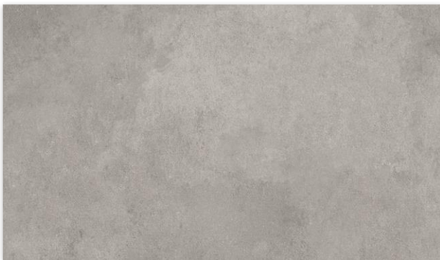
Plinth tiles, of the same material as ceramic tiles, in cladged spaces.

The cladding of the kitchen and bathrooms flooring and the one of the bathroom walls is made with 30x60 high quality porcelain tiles, with a design that mimics white natural calacatta type stone, for the walls of the bathrooms and gray for the floors (kitchens and bathrooms). Modern means of production allow the design of a tile not to repeat itself very often, thus obtaining a very close appearance to the natural stone, but with the advantage of light maintenance.